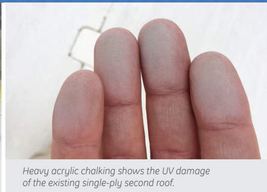
Heavy acrylic chalking shows the UV damage of the existing single-ply second roof.